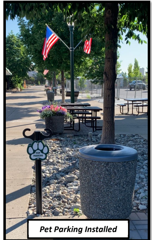
Pet Parking Installed