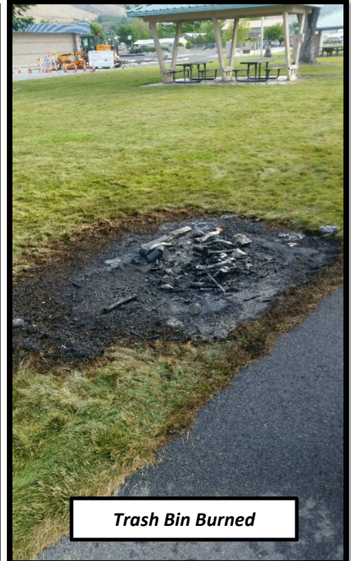
Trash Bin Burned